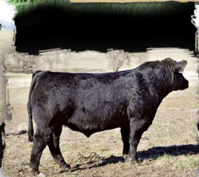
SimAngus by Beef Maker