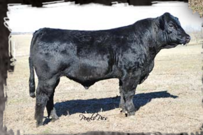
SimAngus by Fusion