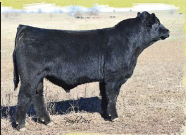
FLYING H ASSET 1002Y

249 X O C C Mitchell 831M BD: 1/23/2011 • SimAngus