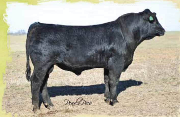
FLYING H Y109

CAJS Jillians Trademark X H S A F Bando 1961 ASA# 2601461 • BD: 1/09/2011 • SimAngus