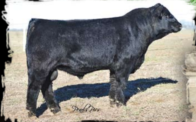
SimAngus by Undreamable

100+ Bulls Sell! MANY JUST LIKE THIS RECENT TOP SELLER!!!