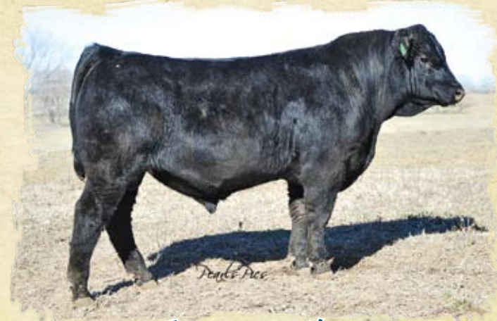
FLYING H Y156

CAJS Jillians Trademark X H S A F Bando 1961 ASA # 2601499 • BD: 2/15/2011 • SimAngus