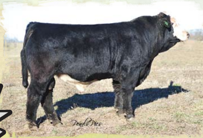
FLYING H Y117

CAJS Jillians Trademark X K A F Dateline Erica ASA# 2601470 • BD: 1/16/2011 • SimAngus