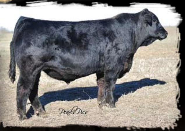
Balancer by Rock Star