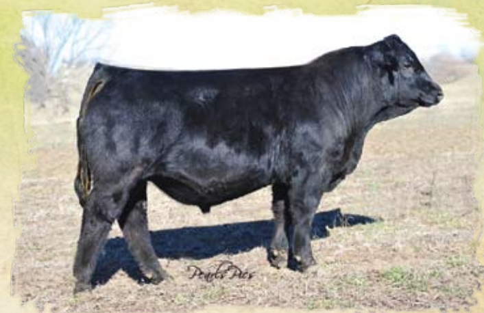
FLYING H MR 117Y

CJ SH Liquid Asset 8660 X Meyers Bonus ASA# 2592753 • BD: 1/05/2011 • SimAngus